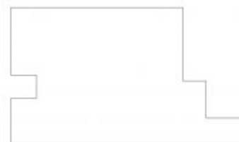
STORAGE APPROX. 6m 2 GROUND FLOOR